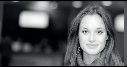
I WILL GIVE YOU SOMETHING TO THINK ABOUT