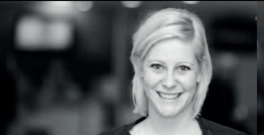
I WILL ACT OUT OF THE BOX