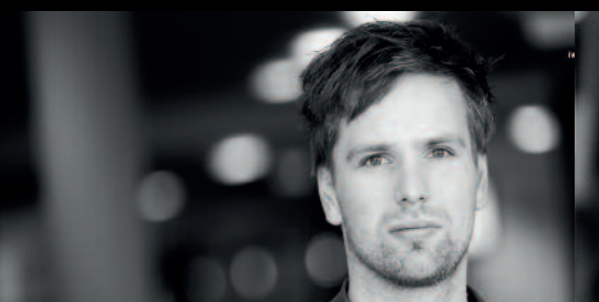
I WILL MAKE THE DIFFERENCE