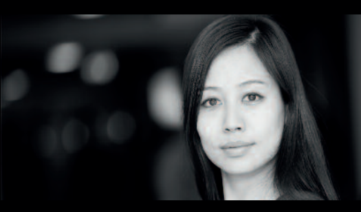
I WILL FIND OR MAKE A WAY TO ACHIEVE MY GOALS