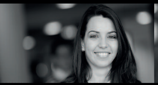
I WILL INSPIRE PEOPLE TO CHASE THEIR DREAMS