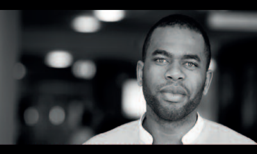
I WILL LISTEN, LEARN AND LEAD