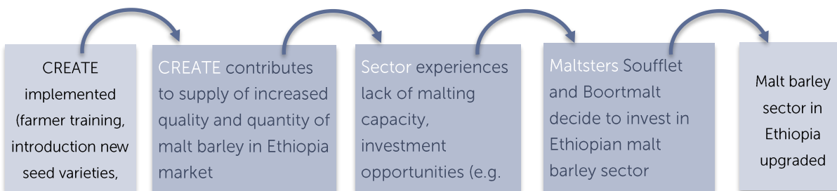
Figure 1. Causal process of CREATE's contribution to upgrading the malt barley sector

http://repository.smuc.edu.et/bitstream/123456789/2676/1/Tarekegn%20Garomsa_Main%20Doc_Final.pdf