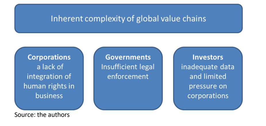
Figure 2. Why abuses of human rights by business continue