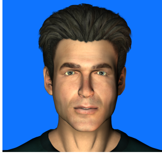
Figure 1 - Sample Embodied Agent

We have created an automated kiosk that uses embodied intelligent agents (avatars) to interview individuals and detect changes in arousal, behavior, and cognitive effort by using psychophysiological information systems. We initiated this research stream from intelligent agent architectures, embodied conversational agent studies, influence tactic literature, and interpersonal deception research. One of the embodied intelligent agents that we created is shown in figure 1 and the kiosk is shown in figure 2.